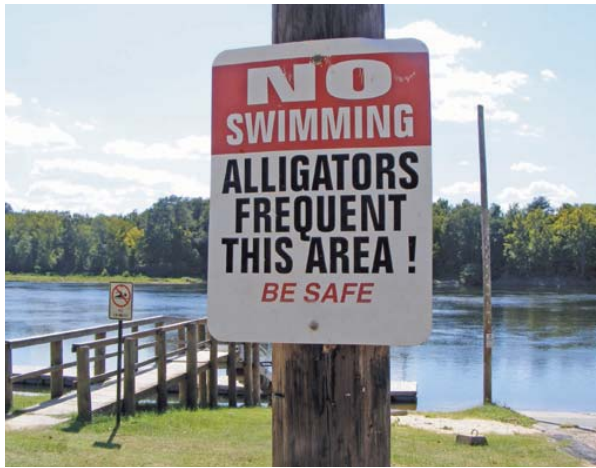
Lizabeth West, FWC

Do not swim outside of posted swimming areas or in waters that may be inhabited by alligators.